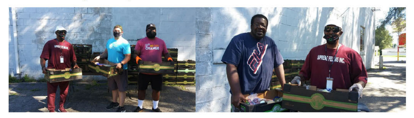
This event distributed food to the community during the pandemic, so the elderly were able to access supplies.

Food distribution efforts: We currently support other organizations in their efforts to donate food to the community. If funded, we would like to host our own food distributions.